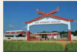
The ICFAI University, Nagaland