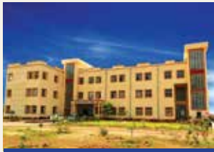
The ICFAI University, Raipur