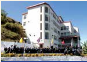
The ICFAI University, Mizoram