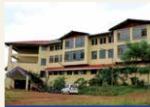
The ICFAI University, Meghalaya