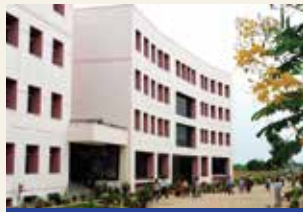
The ICFAI University, Tripura