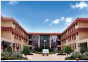
The ICFAI University, Dehradun

ICFAI has established 11 Universities across India. The ICFAI Universities are located at Hyderabad [The ICFAI Foundation for Higher Education (IFHE), which is a Deemed-to-be University], and Dehradun, Himachal Pradesh (Baddi), Jaipur, Jharkhand, Meghalaya, Mizoram, Nagaland, Raipur, Sikkim and Tripura are state established private Universities.