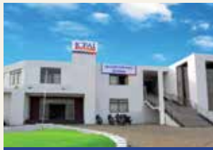
The ICFAI University, Jharkhand