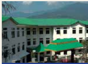
The ICFAI University, Sikkim