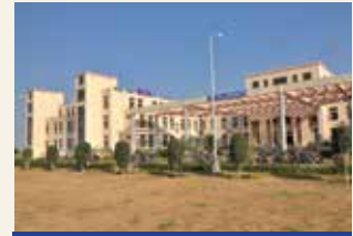
The ICFAI University, Jaipur