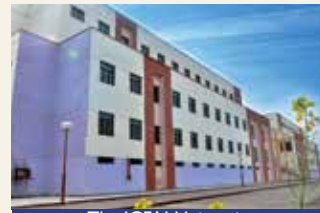
The ICFAI University, Himachal Pradesh (Baddi)